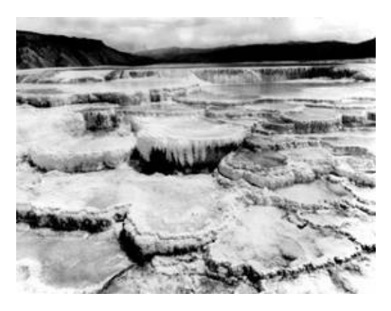
Mammoth Hot Springs

The trip will be limited to 10 participants, so sign up soon to reserve your spot. There will be an informational meeting where you can get all the details on this trip. During this meeting, Les will show you the sites you will see during the trip. Also, equipment needed, and all the details for the trip will be discussed. This informational meeting will be held February 6, 2013 at the DACC Village Mall office starting at 6:00 p.m