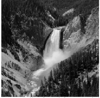
Lower Falls, Grand Canyon of the Yellowstone