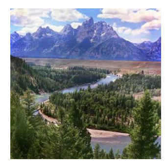
Snake River and the Tetons